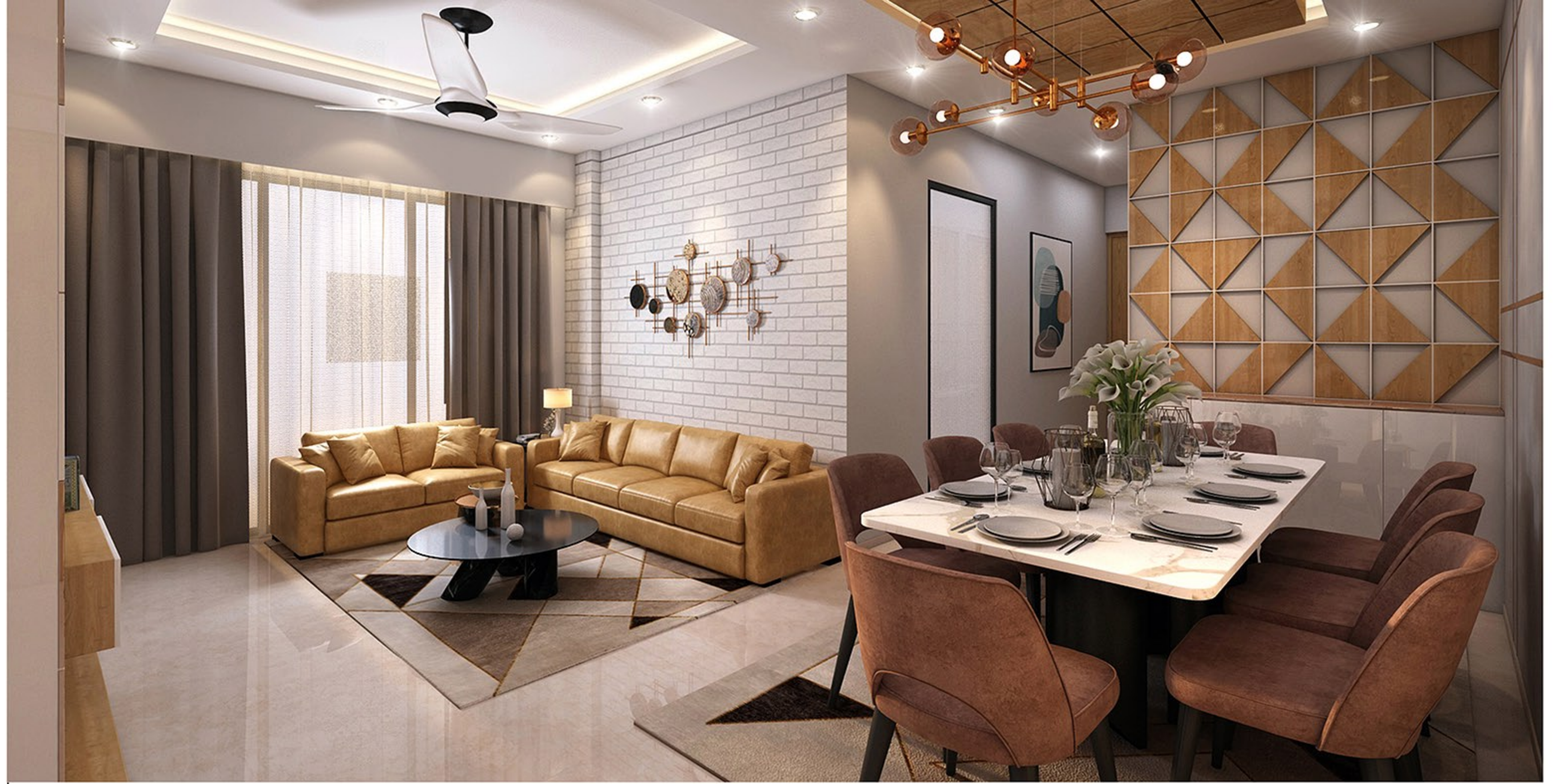
Lavish 3 BHK Artistic Impression