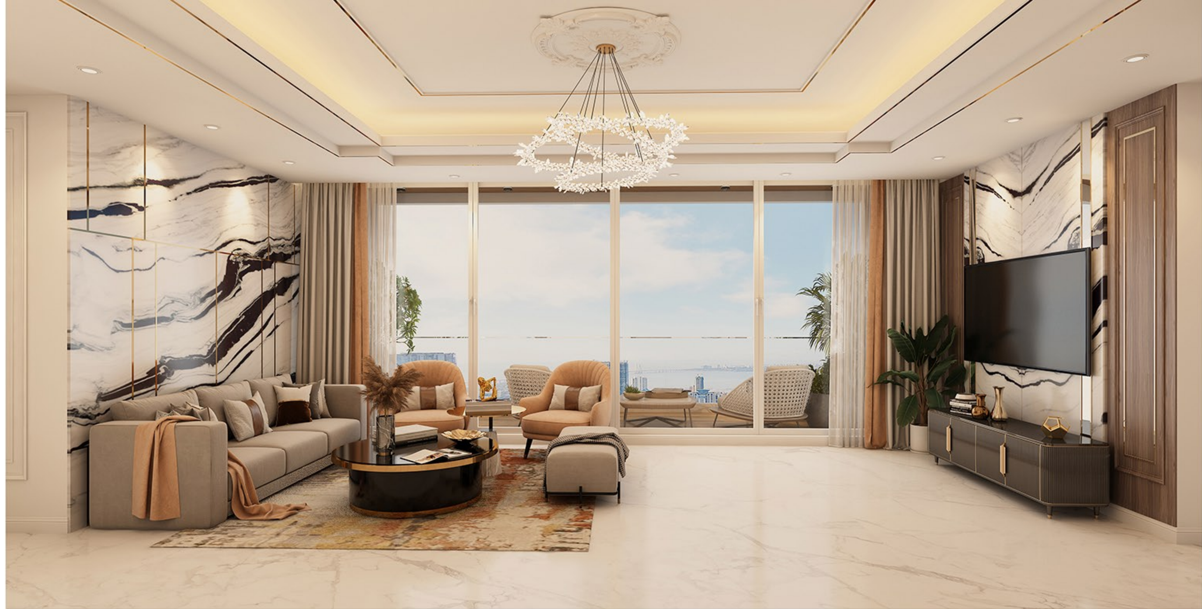
4 BHK Livingroom Artistic Impression