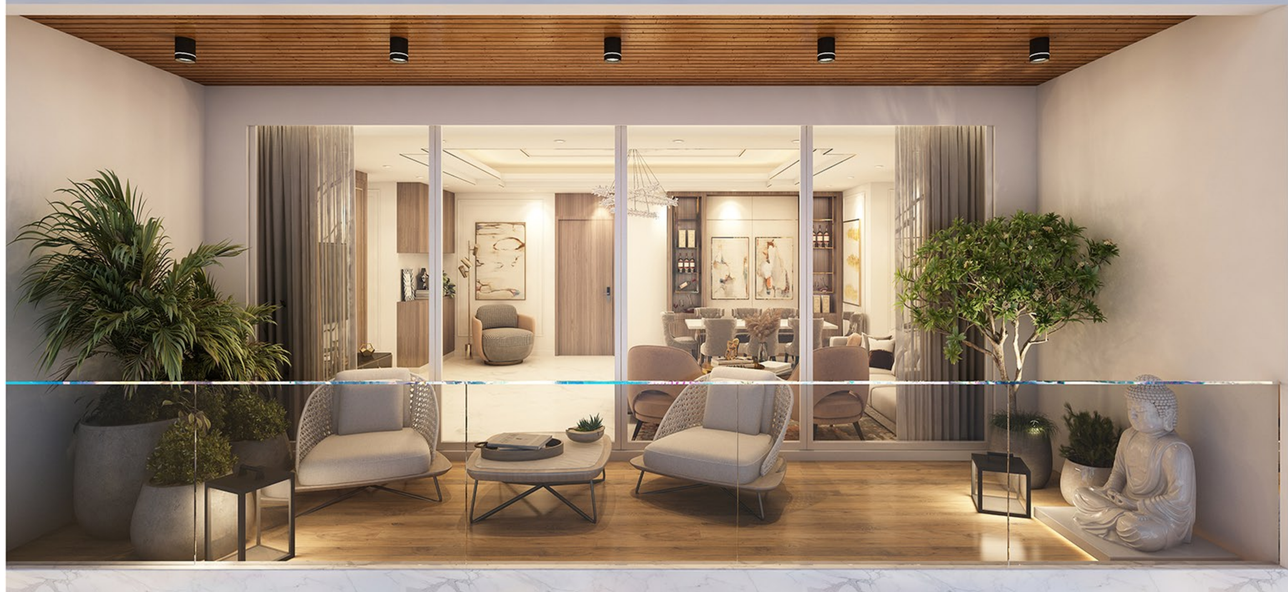
4 BHK Balcony Artistic Impression